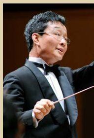
指挥：葉聰 Conductor: Tsung Yeh