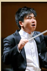
指挥：倪恩辉 Conductor: Moses Gay

票价 (未加 SISTIC 收费) Ticket Prices (exclude SISTIC fee) $30, $20